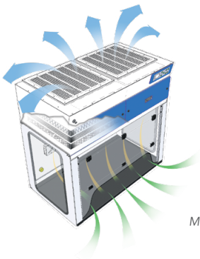
Models P10-XT and P20-XT.