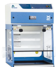
Models P5-36-XT (RX) and P5-24-XT (RX).