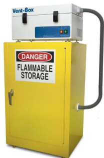
Model VB60. Storage cabinet not included.

airscience.com/custom-engineered-products