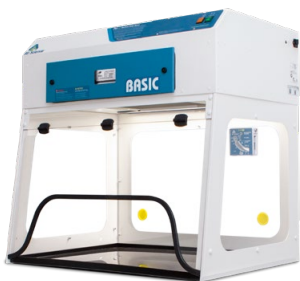
Models P5-24-XT and P5-36-XT.