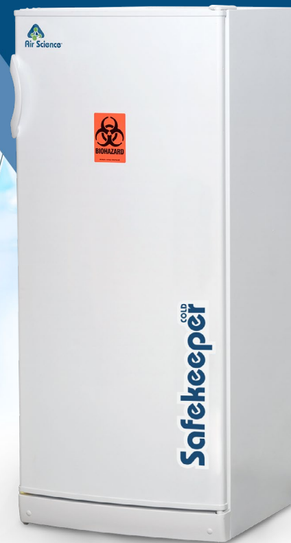
Safe KEEPER ® COLD