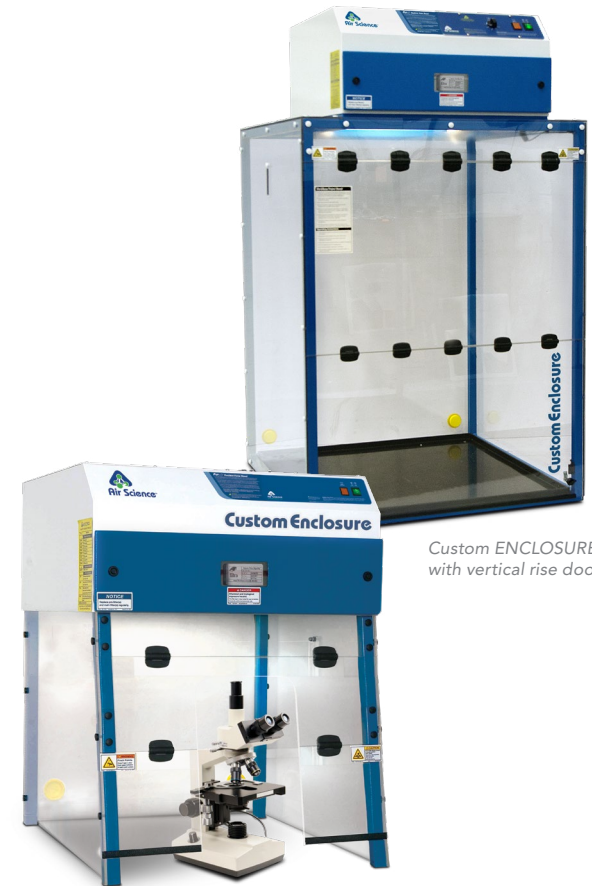
Custom ENCLOSURE with vertical rise door.