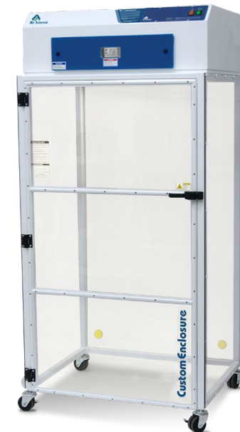
Tablet Press Enclosure