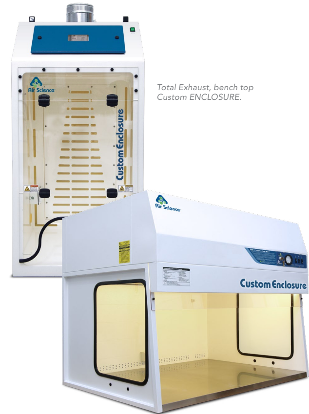
Total Exhaust, bench top Custom ENCLOSURE.